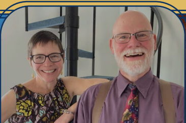
IVORY & GOLD®